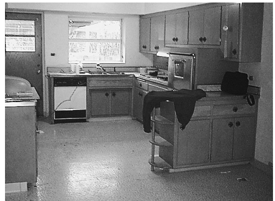
1 - BEFORE