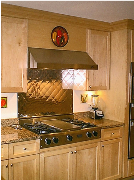
9 - Kitchen Cooktop