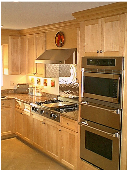
3 - Kitchen Ovens