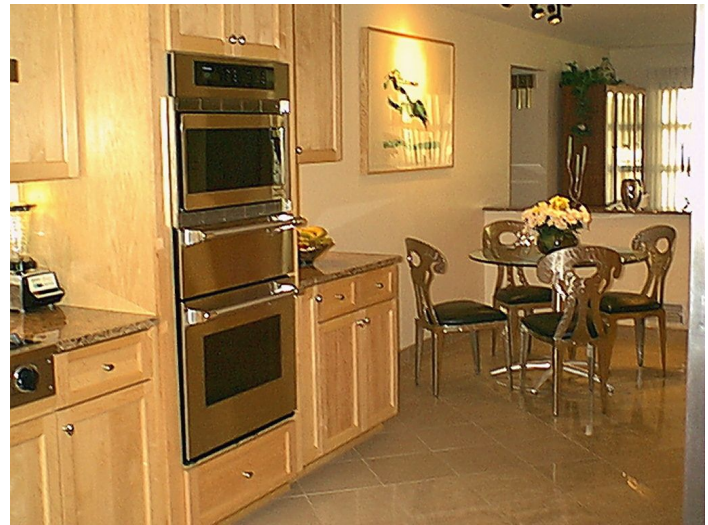
8 - Kitchen Ovens / Dining