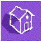
Residential Architect Magazine gave our web site a great review, January 1998