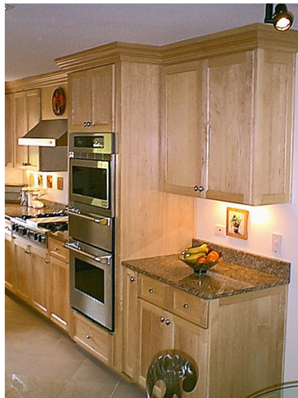
7 - Kitchen West