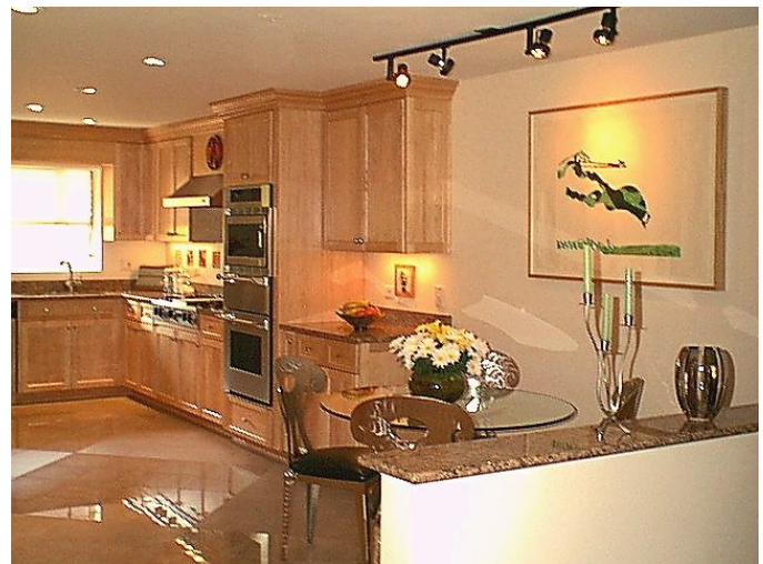
2 - Kitchen West