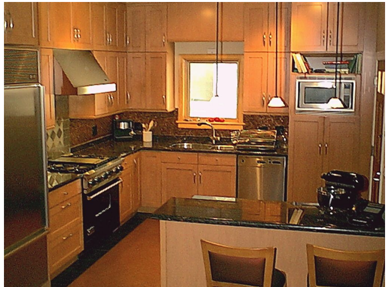
Interior, Kitchen Area