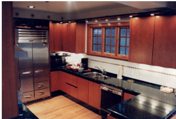
Northwest at Sink