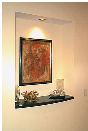
Focal Niche at Entry

Chicago, IL 5,000 SF House Completion 12/2001 Basement Remodel 2003 © copyright Susan Grant 2001-2005