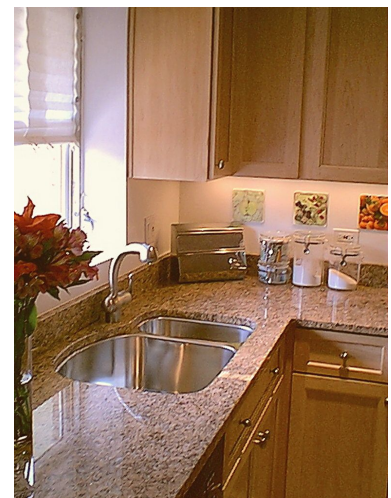
5 - Sink Area