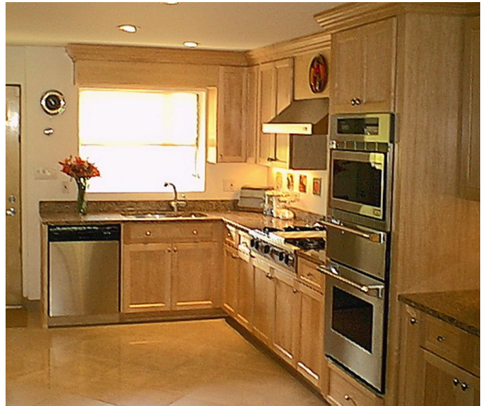
4 - AFTER, Kitchen Cookline

General Remodeling 1,800 SF; Kitchen -245 SF Completion - 12/ 2002 © 2002-09 Susan Grant