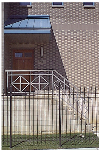
South Entry Detail

Chicago, IL 5,000 SF House Completion 12/2001 Basement Remodel 2003