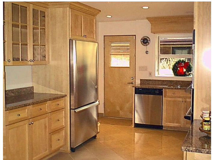
6 - Kitchen SouthEast