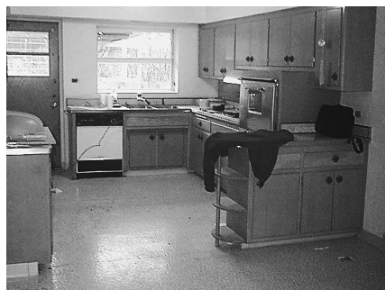
1 - BEFORE