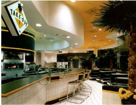
California Pizza Kitchen Oak Brook, Illinois various US locations

Post Office Box 5097 Chicago, Illinois 60680-5097 773.548.3322 susan@susangrant.net