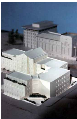
UCB Student Services Ctr. Berkeley, Calif.