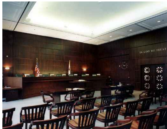
Supreme Court of IL State of Illinois Building Chicago, Illinois