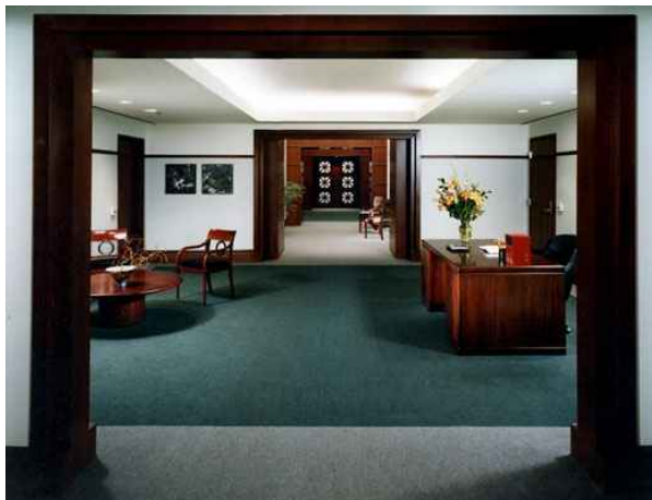
Supreme Court of Illinois Court Offices • Chicago, Illinois