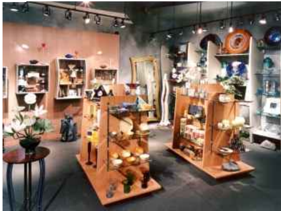
HoyPoloi Gifts Walt Disney World, FL