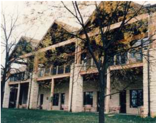
Eagle Ridge Resort Galena, Illinois