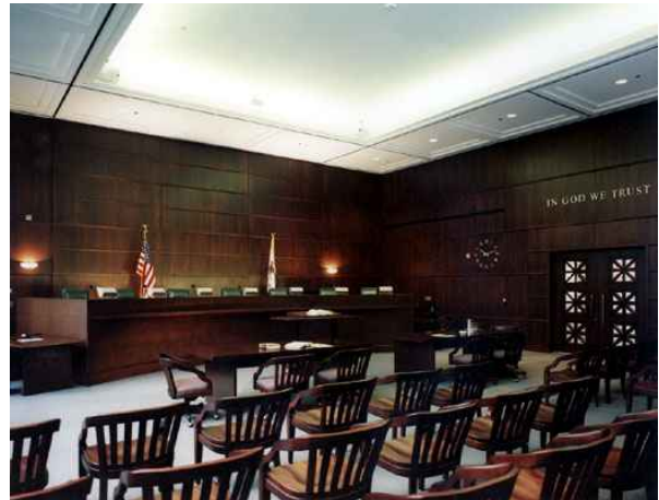
Supreme Court of Illinois Chicago, Illinois