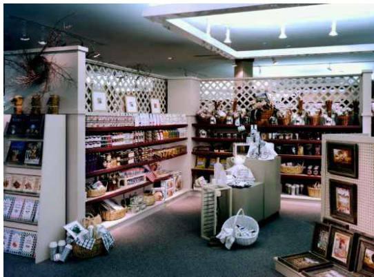
Country Sampler Appleton, WI