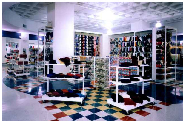
US Factory Outlet Discount Retailer Springfield, MA